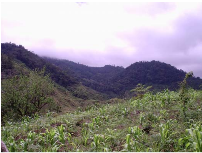
Looking toward protected watershed from Nueva Vida corn field

The effort was launched with a Sunday afternoon planning session in April at Nola's house on the coastal highway near Omoa. More than a dozen residents of the mountain communities participated (most having walked for miles to reach the highway). The group agreed on a name ("Fundacion Eco Verde Sostenible," or "FECOVESO") and a mission statement ("To support community efforts to protect the environment of Northwest Honduras and promote the health, education