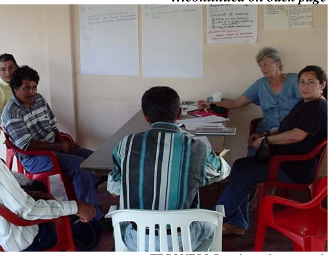
FECOVESO Board members at work