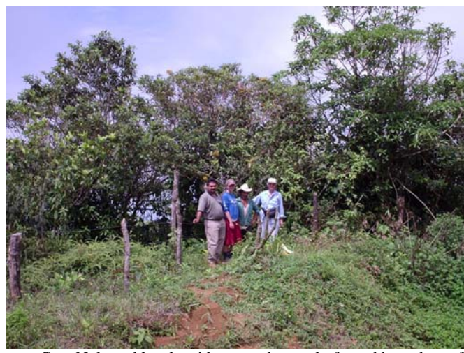
Gen, Nola and local residents on the newly fenced boundary of protected watershed near Cerro Negro (see map on back page)

-- NPR report (7/6/04) on a demonstration in Tegucigalpa