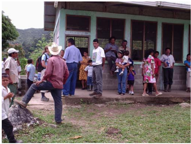
Nueva Vida residents gathering for meeting at the school

The communities solicited funding from HCSC for materials for a suspension bridge that would provide a dry, safe crossing in all seasons. We agreed to help, and our commitment allowed them to obtain additional funding, so they were able to complete the bridge.