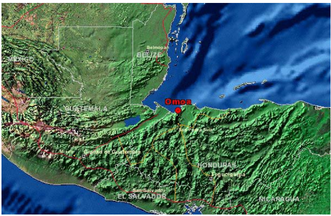
Location of Omoa on north coast of Honduras

Honduras Community Support Corporation 137 Shepard Avenue Saranac Lake, NY 12983 (518) 891-0417 www.hcsc-honduras.org