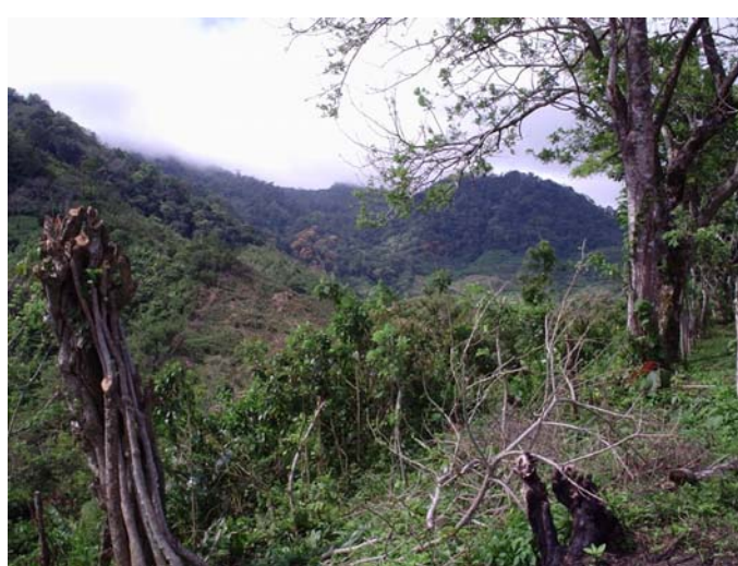
Looking northwest from the Cerro Negro height of land. The most recently acquired parcel of protected watershed land lies immediately below.

In October, FECOVESO's initial Board members met to begin developing policies for the management of these lands. Although it is possible that watershed protection can be combined with limited community use of the land for other purposes, the board was unanimous in insisting that the cutting of trees could not be permitted for any purpose and that HCSC should seek professional advice regarding the reforestation of areas where cutting has taken place. Projects addressing other needs of these subsistence communities are also being discussed.