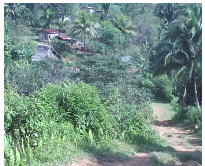
The community of Las Brisas de Rio Negro

HCSC has played a critical role at several points in the two-year process – beginning with the acquisition of land surrounding the water source, and concluding with "gap funding" that allowed completion of the project by covering costs not covered by