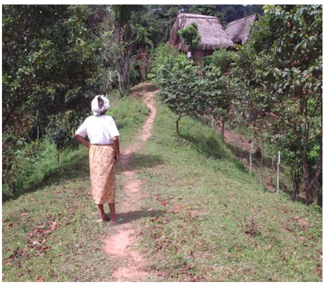
A Las Brisas de Rio Negro elder on a community byway.

In addition to its water system assistance, HCSC has provided funding for the community's purchase of land for a new school to replace the seriously overcrowded existing school building. With a building site secured, the community can now qualify for a government program that will build a new school.