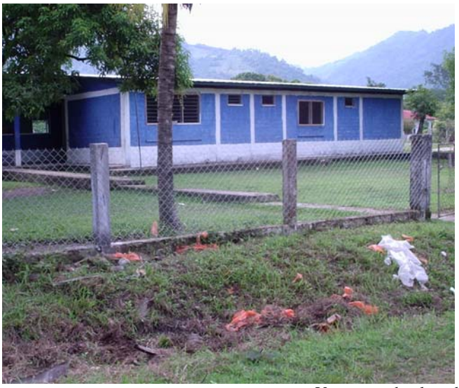
Veracruz school yard

The community of Milla Tres was given a matching grant for a badly needed new school roof. Replacement of the existing leaky roof with a more durable new roof will be a major expense. HCSC committed a substantial portion of the cost and asked the community to try to raise the balance from the regional government and from families within the community. The local school committee ("Padres de Familias") has agreed to ask each family to contribute 100 lempira (about $5) for the project.