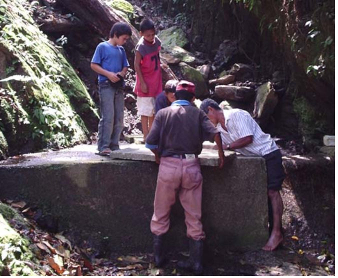
The small dam that impounds water to supply the Las Flores system

The FECOVESO board is intensely interested in the reforestation of these watershed parcels, most of which have suffered from cattle grazing, as well as the cutting of trees. HCSC and FECOVESO are planning to complete the fencing of all parcels to exclude cattle and are now seeking professional help in planning for and carrying out appropriate reforestation.