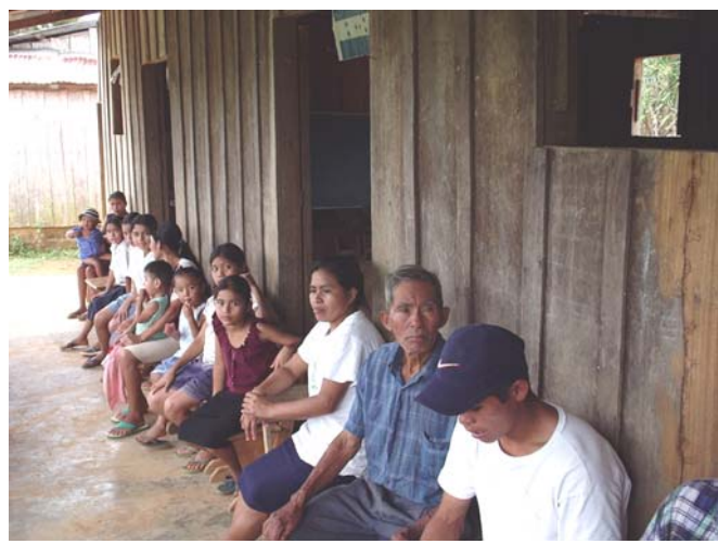
Las Brisas de Rio Negro residents outside the old school building

government sources. In between, HCSC provided transportation (in HCSC's pickup) to and from the remote site (three hours from Omoa on barely passable roads), and Nola spent many hours coordinating the efforts of various players and accompanying community leaders to meetings with government officials.