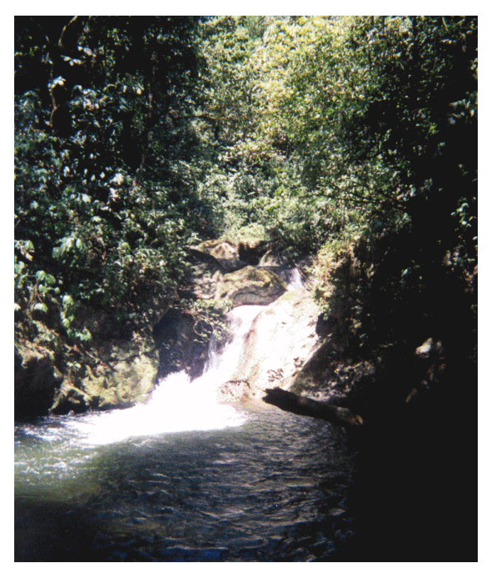
Rio de la Paz in mountain forest