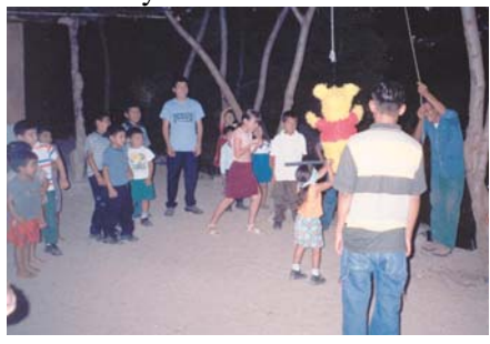
After-dark pinata in Camino Nuevo school yard

HCSC has also received a request for funding to fence in Camino Nuevo's school yard. The Camino Nuevo school is located on the narrow summit of a steep ridge, with only a small piece of level ground in front of the school where children can play. A soccer ball that escapes from this small area ends up at the bottom of a ravine a hundred yards below. A fence would help keep the ball in play, as well as increasing the security of the school.