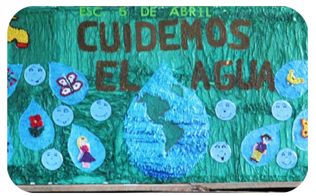
Sign made by school children to tell everyone: "We take care of the water!"

This is an all day event celebrating the completion of a water system that serves four communities. They have included a focus on education, appreciation and protection. Work has been supported in construction, expansion or repair of 35 water systems since 2001.