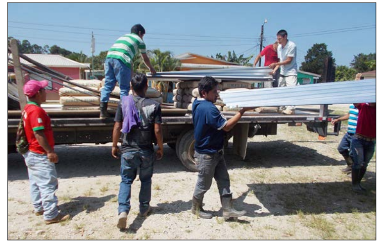
Unloading materials for a water system for San Miguelito, Quimistán, and materials to repair school latrines and replace the roof in La Providencia.