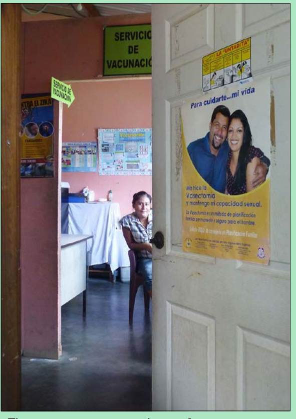
The vaccination room, with an informative poster about vasectomies.