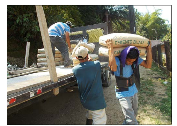
Materials for a new roof and outbuildings for San Martín and school repair in Santo Domingo.