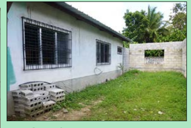
Consulting room in progress

These dedicated nurses are pleased to receive the donated medical supplies! FECOVESO also supplied materials to add a room in Tegucigalpita and a new consulting room in El Paraiso. These clinics are on the coast, but serve many who come down from the mountain communities.