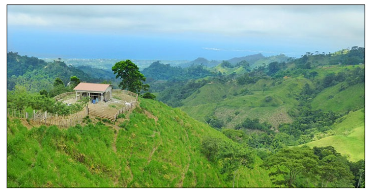
Note the ocean in the distance and imagine the hours of ups and downs, most often on foot, to get to this school. This mountainous terrain is a huge factor in the wide spread locations of the homesteads.

School Projects. We have provided funding for the construction, repair, and improvement of 53 elementary schools, as well as for essential supplies such as individual desks and whiteboards and a bonus for teachers who have to travel the furthest. New schools were built this year in two communities hours away from the coast.