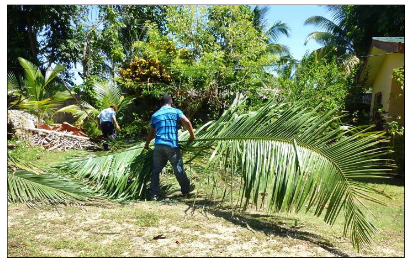
With a large donation of huge Manaca Palm leaves from the community of Barbas Cheles, FECOVESO volunteers are constructing an outdoor space for their meetings when the temperature is high, and to house and protect Nola's car from the salt of the ocean.