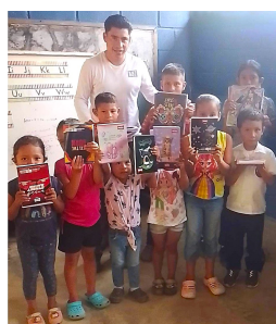
School children in Monte Sinai showing off their new notebooks provided by FECOVESO

FECOVESO continues working with unflinching commitment and enthusiasm. Its members take great pride in what they are able to accomplish, and are very appreciative of your interest and generosity in providing the funds that enable them to continue! Donations are gladly accepted by check or at www.hcsc-honduras.org/donate.html