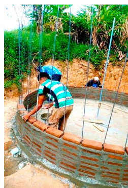
Las Mejias - building and completion of new water tank