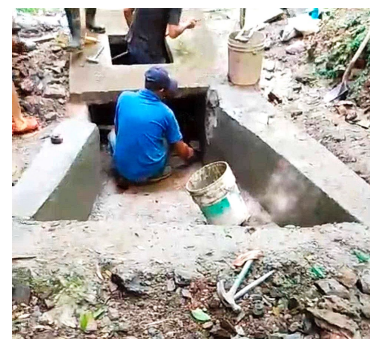
Water system repair - Santo Domingo

Greetings! This past year was a challenging one for many Honduran communities. Intense flooding from hurricanes and storms, with resulting landslides, have created many demands on FECOVESO, HSCS's Honduran non-profit partner. FECOVESO has provided funding for many communities to repair their water systems - from coastal to steeply mountainous areas of Omoa - as well as for purchase and protection of watersheds, and other projects that community members identify as their most pressing, such as maintenance and repair of schools, health clinics, roadways, bridges, and more.