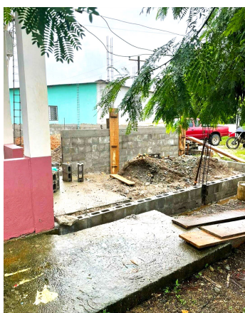
Corinto health clinic addition