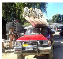
Nueva Vida community members expand their water system with pipes provided by FECOVESO