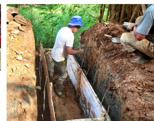
El Liston and Santo Domingo road improvement project