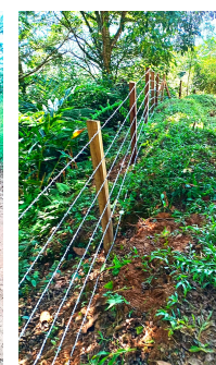
FECOVESO provided materials to Santo Domingo to fence and protect their watershed

Your donation, of course, is tax deductible. Honduras Community Support Corporation is recognized by the IRS as tax exempt under Section 501c(3) of the code and is registered as a charity with the New York State Attorney General's Office