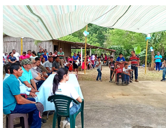
Celebration of a new water tank, with its strong flow of water